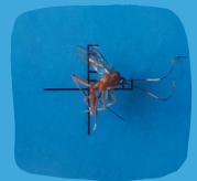
Ants, wasps, midges, spiders.

Mozzie Monitors acknowledges our partners: